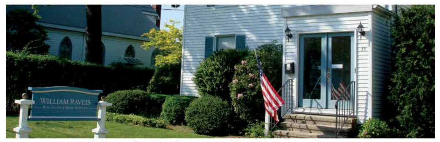
Let our family show your family the way home.

Contact us today to schedule a consultation to discuss the value of your home and our specialized service plan just for you!